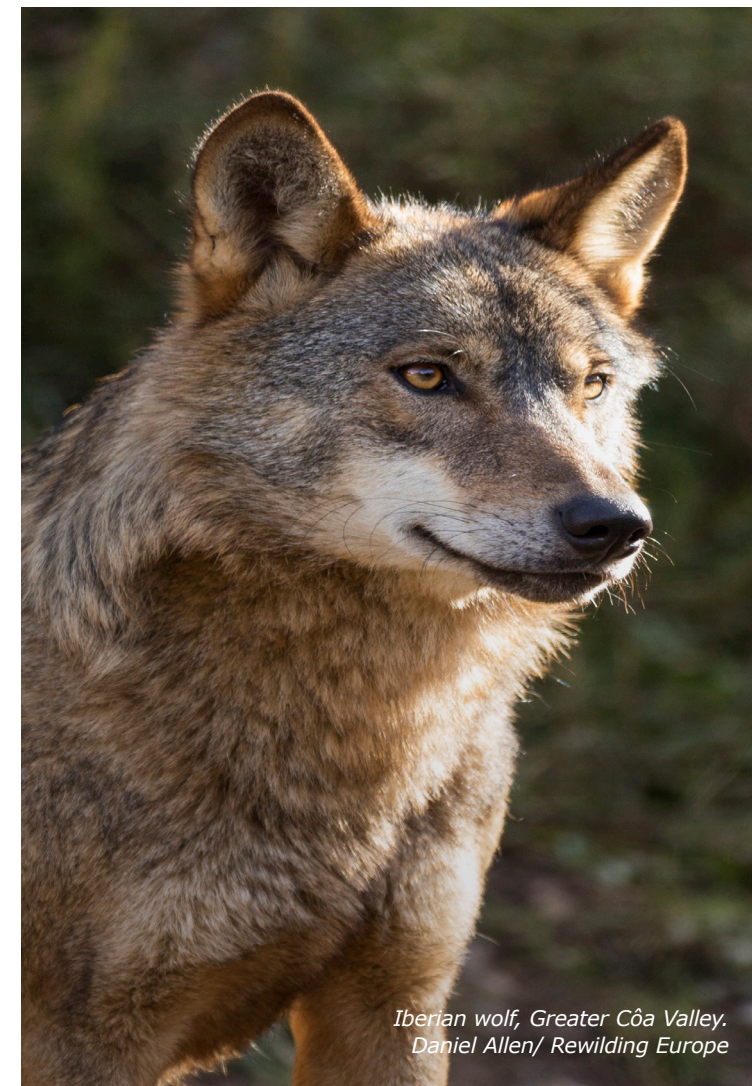
Iberian wolf, Greater Côa Valley.

The decision to swing on the branch may be considered a culpable act of the injured person. Although there may be a presumption of fault of Landowner E, the culpable act by the injured person may exclude or mitigate the liability of Landowner E.