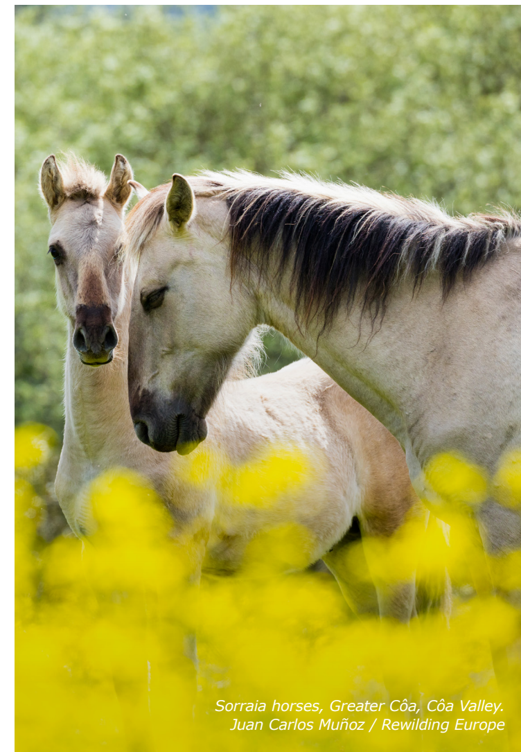
Sorraia horses, Greater Côa, Côa Valley.

This situation is not included in the special provision mentioned in this section because there is no collapse of a man-made structure due to a construction or maintenance defect. Therefore, it falls under the general rule which states that there is only liability if the broken leg can be causally linked to an unlawful faulty act or omission. This unlawful act or omission can include e.g., breach of a legal provision designed to avoid damage to the visitor, such as a safety regulation applicable to the situation.